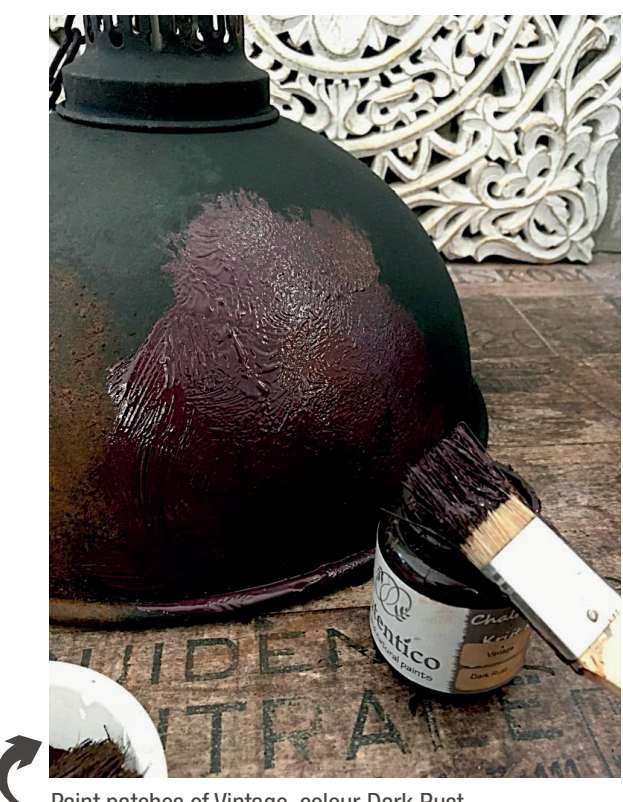
Paint patches of Vintage, colour Dark Rust