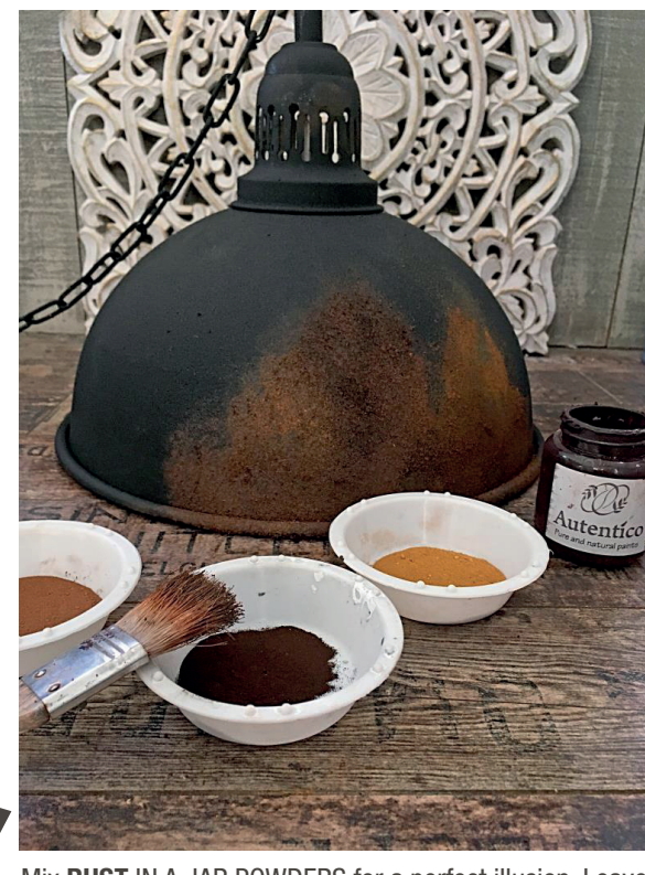
Mix RUST IN A JAR POWDERS for a perfect illusion. Leave GOLD RUST in the background, followed by RED and DARK