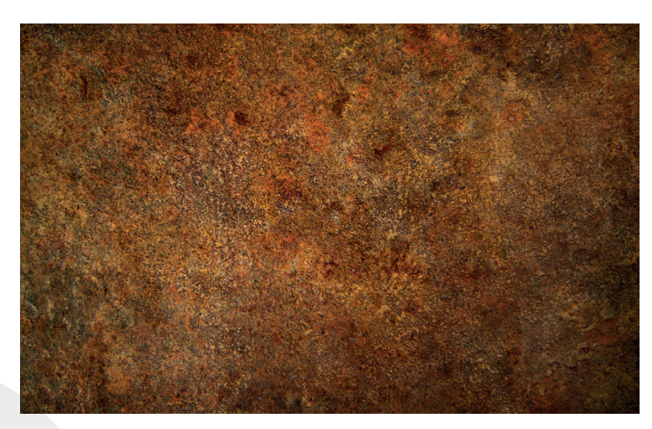
Final result of "RUST IN A JAR" application on a wall