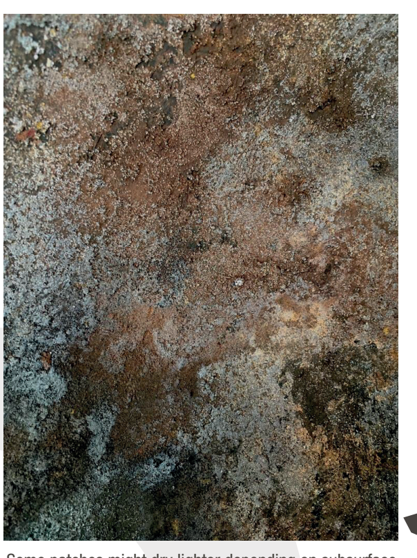
Some patches might dry lighter depending on subsurface -