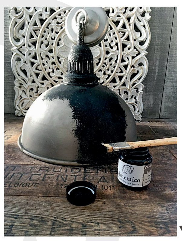
Cover lamp base with a coat of Vintage Nocturnal

Below a guide on how to apply RUST IN A JAR on a lamp.