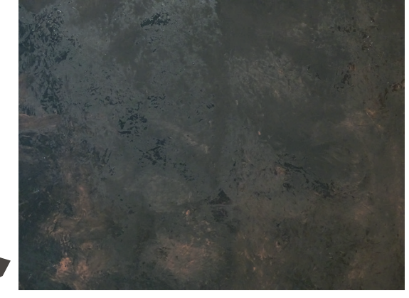
Mottled effect with patches of Nocturnal and Dark Rust

Next step is to create the first oxidation layer. In the illusion of rust, this is the oldest layer of rust. Mix 1 part of GOLDEN RUST powder with 1 part of Autentico RUST BASE . The result is a thick and grainy paste. Apply by brush in an irregular pattern. While the paste is still wet, apply dry powder of GOLDEN RUST in the patches of GOLDEN RUST paste to create highlights. Let dry to avoid smutches with the next layers.