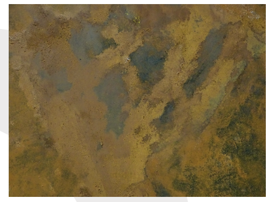
Patches of RED RUST applied with a paste of RED RUST

Next step is to create the second oxidation layer. In the illusion of rust, this is the next layer of rust. Mix 1 part of RED RUST powder with 1 part of Autentico RUST BASE . The result is a thick and grainy paste. Apply by brush in an irregular pattern on top and overlapping the patches of GOLDEN RUST . Only cover parts of the prior layer of GOLDEN RUST . While the paste is still wet, apply dry powder of RED RUST in the patches of RED RUST paste. Let dry to avoid smutches with the last layer.