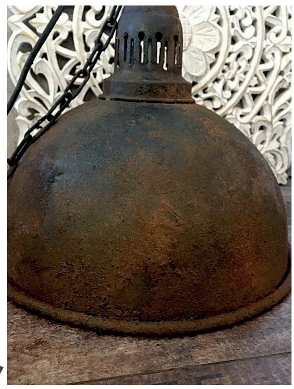
Leave to dry for several hours.