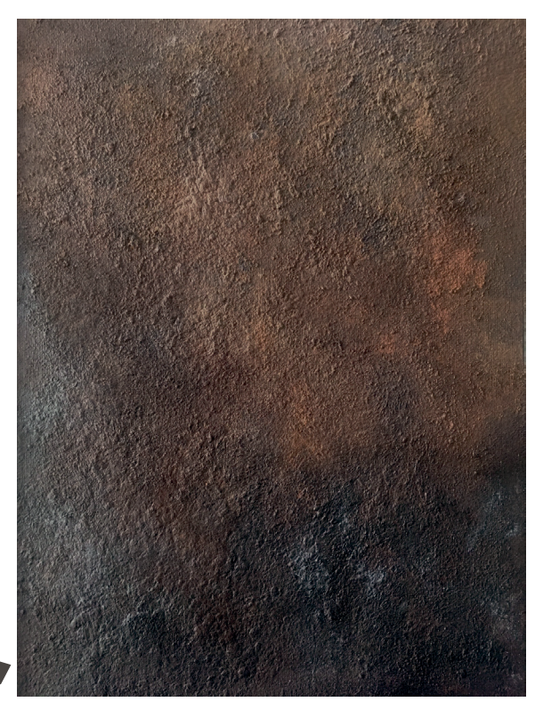
Apply Autentico BLACK WAX to make result darker