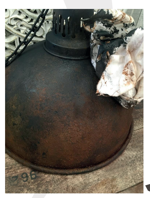
Dabble with a cotton cloth