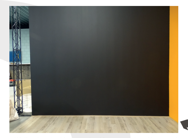
Wall painted with Autentico Vintage, colour Nocturnal

Paint the subsurface using Autentico Vintage, colour Nocturnal. Vintage is a porous paint and is ideal as a base for rust effects. While the paint is still wet, paint patches with Vintage, colour Dark Rust. Make smudges to create a mottled effect showing patches of black and lighter hues, just like a beginning oxidation process would do. Let the coats dry before continuing.