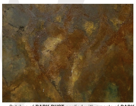
Patches of DARK RUST applied with a paste of DARK

Next step is to create the third oxidation layer. In the illusion of rust, this is the last layer of rust. Mix 1 part of DARK RUST powder with 1 part of Autentico RUST BASE . The result is a thick and grainy paste. Apply by brush in an irregular pattern on top and overlapping the other patches. Only cover parts of the prior layers. While the paste is still wet, apply dry powder of DARK RUST in the patches of DARK RUST paste. Let dry and enjoy your work.