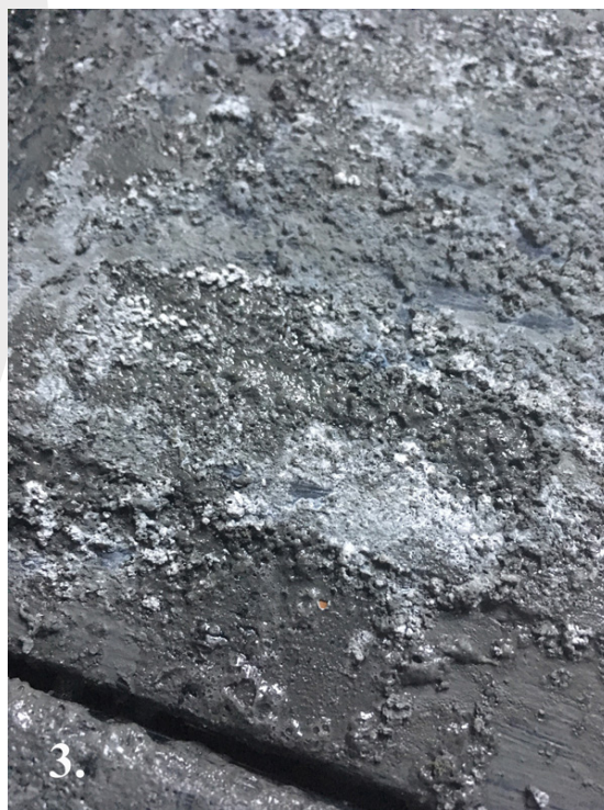
3. SEA SALT FIZZ drying and showing paint craters