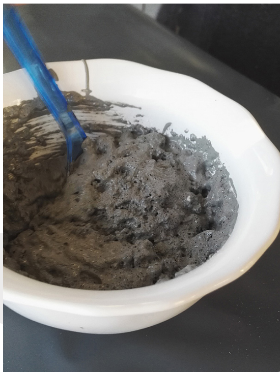
Mixture starts fizzling