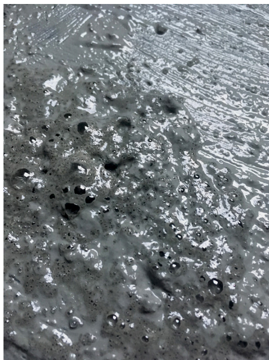
Mixture fizzes and forms paint craters on surface